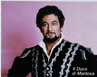
Il Duca di Mantova