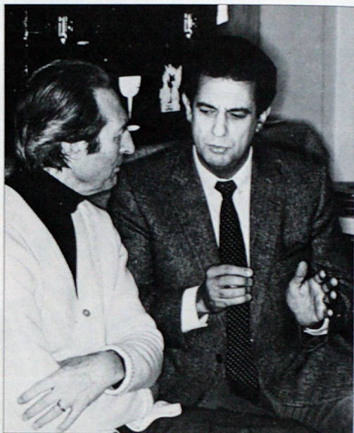
* Verdi «Il Trovatore» - sessions 1984: Carlo Maria Giulini, Plácido Domingo