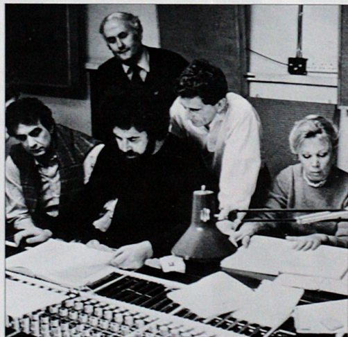
* Puccini «Manon Lescaut» - sessions 1984: Plácido Domingo, Giuseppe Sinopoli, Mirella Freni

Published by Deutsche Grammophon Production (Polydor International GmbH), Alte Rabenstr. 2, 2000 Hamburg 13, Bundesrepublik Deutschland, Telefon (040) 44 19 10. No. 03123